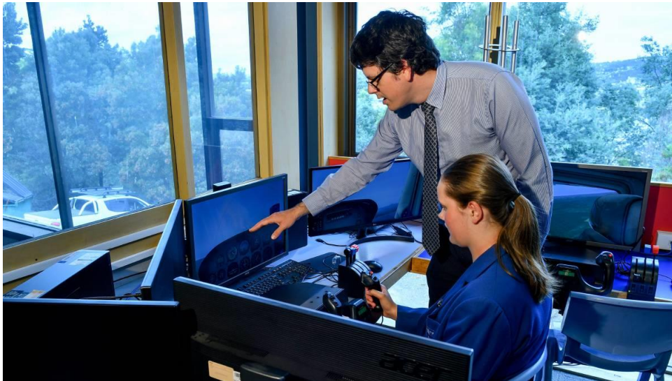
Grammar School’s flight simulator, part of their aviation programme.