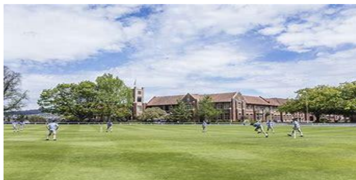
The proposed landing area

A special treat, weather permitting, for both students and guests will be the arrival of a Helicopter Resources aircraft flown by Hoey Stobart that plans to land on the main oval at approximately 1pm. Grammar Junior School students will be bussed over from the Prep School in Lyttleton Street for this activity.