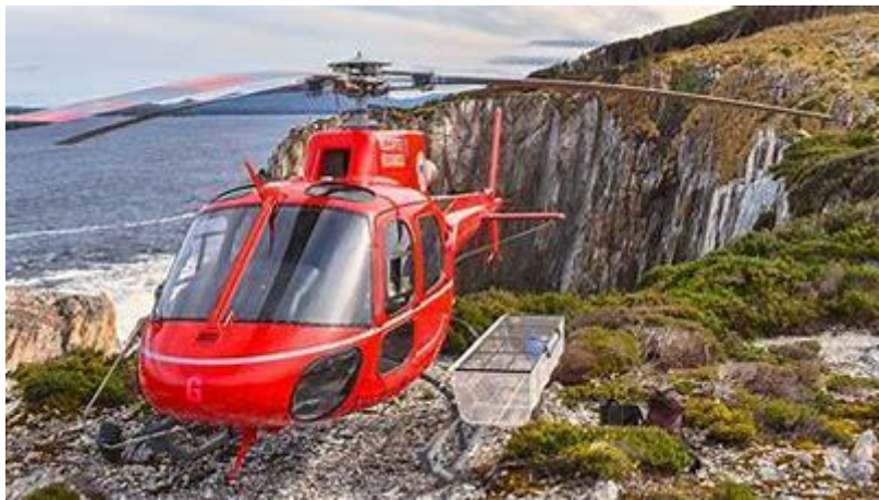
Helicopter Resources Aircraft.

A special treat, weather permitting, for both students and guests will be the arrival of a Helicopter Resources aircraft flown by Hoey Stobart that plans to land on the main oval at approximately 1pm. Grammar Junior School students will be bussed over from the Prep School in Lyttleton Street for this activity.