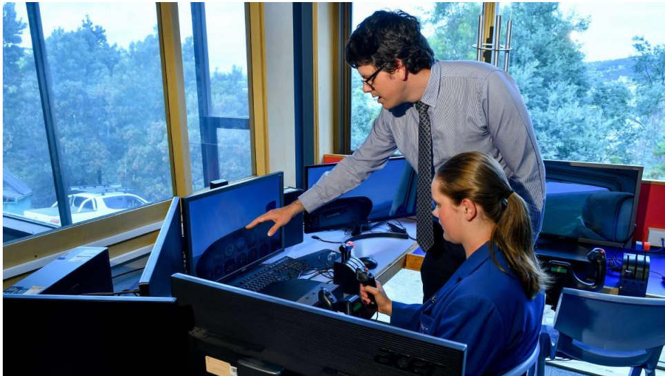
Grammar School’s flight simulator, part of their aviation programme.