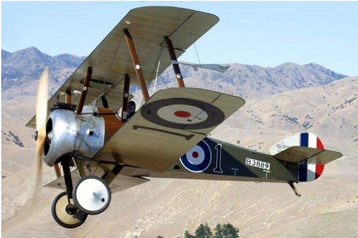
Archive photo of a Sopwith Camel – type flown by Brownwell

Following World War 1, Brownwell returned to Australia, joining the Royal Australian Air Force (R.A.A.F.) serving with Number 1 Squadron from 1926 to 1928 and at RAAF Base Pearce (No 23 City of Perth Squadron) between 1938 and 1940. He further served in the following capacities during World War 2.