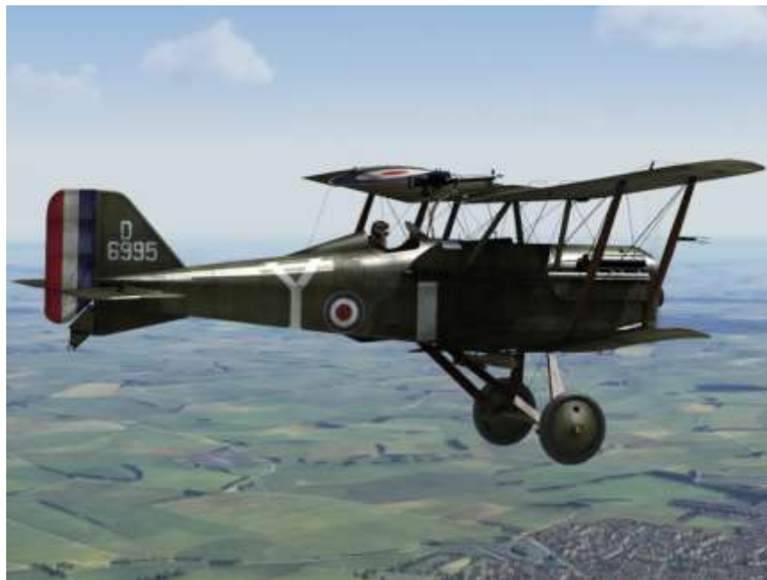
This S.E.5a is the type flown by Frank Alberry while serving with No 2 Squadron during the Autumn of 1918. This aircraft displays the squadron’s later markings depicting a vertical strip behind the cockpit.